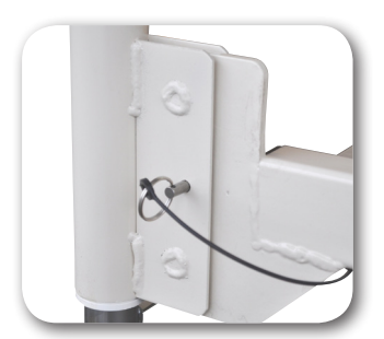
Pin Slot System