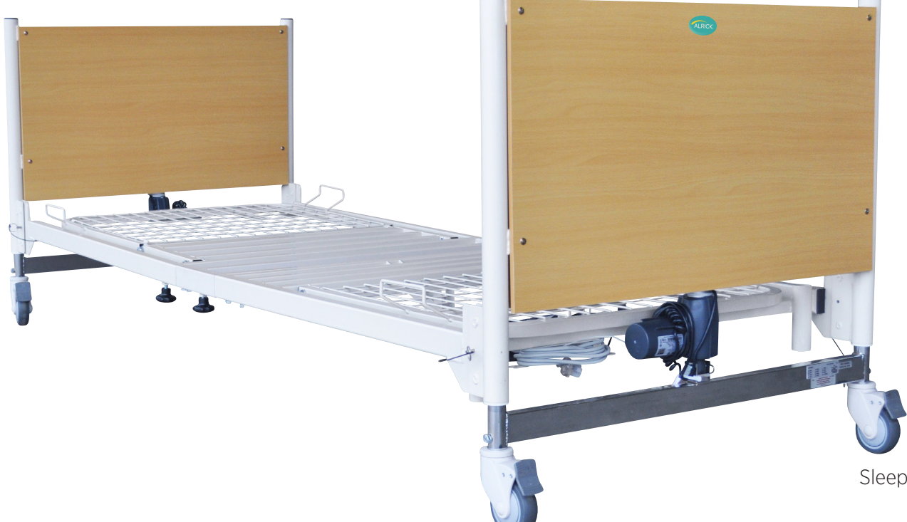
'IDEAL ALTERNATIVE FOR HOME OR SHORT-TERM CARE'

The Alrick 5000 Pull-A-Part Transportable Series is targeted at easy transportation and storage. Ideal for short term care, the 5000 Series can be assembled and dismantled with ease through the incorporation of a simple slot system which is secured with a pin, and folds compactly for storage. Consequently the 5000 Series is an ideal homecare bed, or as a short-term care alternative.