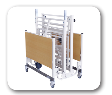
Transport Mode (Folded)