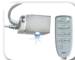
UBL Underbed Lighting/ BLH Backlit Handset