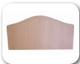
QAS Queen Ann Style