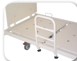
CLP400 Clamp On Support Rail 400mm