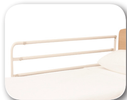
400HR Deluxe Rails