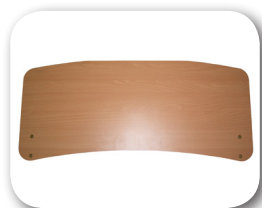
SAS Slender Arch Style