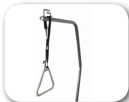
ASHP Self Help Pole