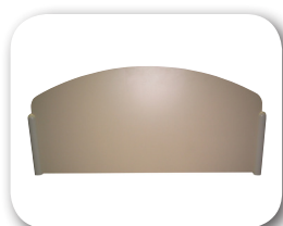
ATCS Aluminium Trimmed Crescent Style