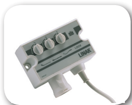
ACM Attendant Control