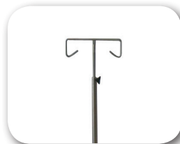
AIVP I.V. Pole