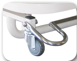
CLOK 100mm Central Locking Castors