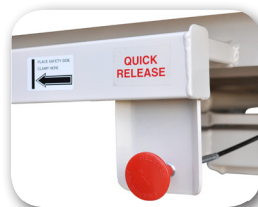
CPR Emergency Release