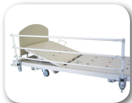
360HR Horizontal Side Rails