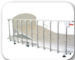
380VR Vertical Side Rails