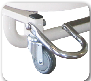
Central Locking Castors