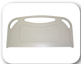
SMS Sculpted Moulded Style

* Most head and foot board styles are available in a range of colours on request.