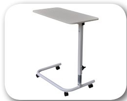
OBT OverBed Table