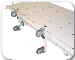
BMR Bed Mover Wheel Set