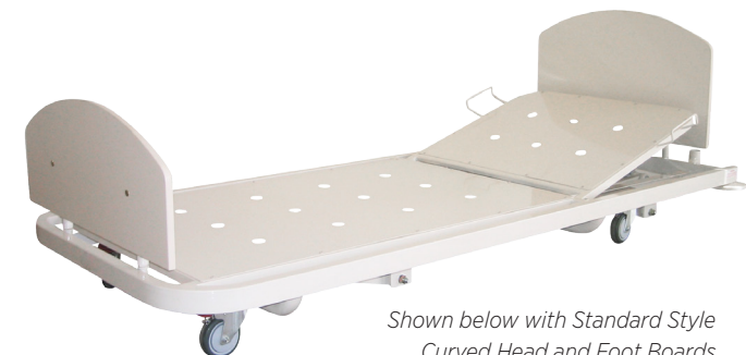
Shown below with Standard Style Curved Head and Foot Boards

*Two models are 7001 with kneebend and vascular support , 7500 without kneebend and vascular support.