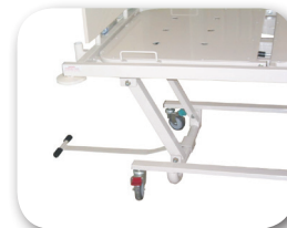
TBR7000 T Bar Buffer