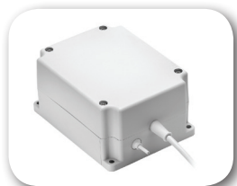
ABB Battery Backup