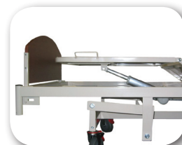
VSE Electric Vascular Support