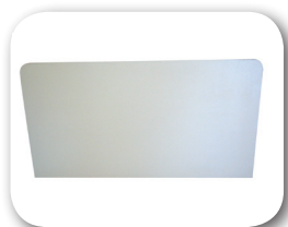
SS Square Style