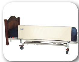
COT PRO Padded Side Rail Protectors