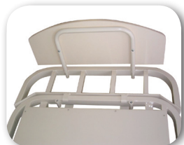
C.EXT 200mm Clip On Extension