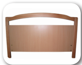
DTWS Duet Tone Wooden Style