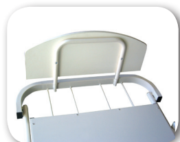
PO EXT 200mm Pull Out Extension