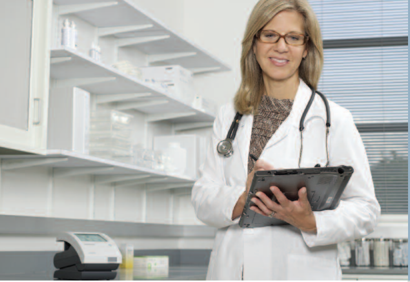
Connectivity provides easy access to patient results

CLINITEK Status Family of Analyzers – the next generation of urinalysis analyzers developed with the help of continuous customer input