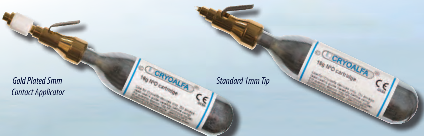
Gold Plated 5mm Contact Applicator

"Choose between the Standard or Contact Application Tip"