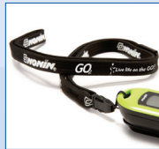
GO2L Black 20" Lanyard