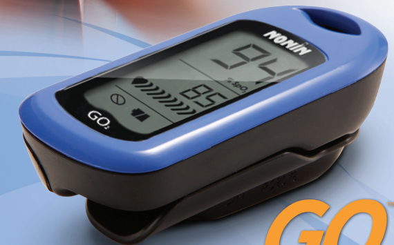
GO 2 Fingertip Pulse Oximeter