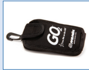
GO2CC Black neoprene carrying case with belt loop