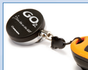
GO2R Retractable Clip Holder