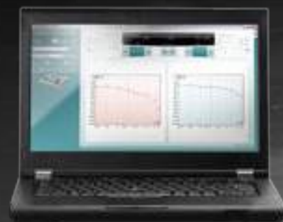
Diagnostic Suite software (AS608e only)