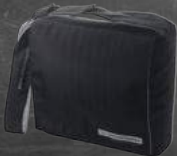
The soft carrying case

The AS608 / AS608e will operate with 3 standard AA batteries or a medically approved external power supply. Typical battery life is six months.