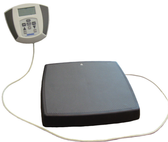
Remote Display can be mounted on a wall or placed on a table