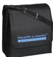
Carrying Case for 844KL Item# 64771